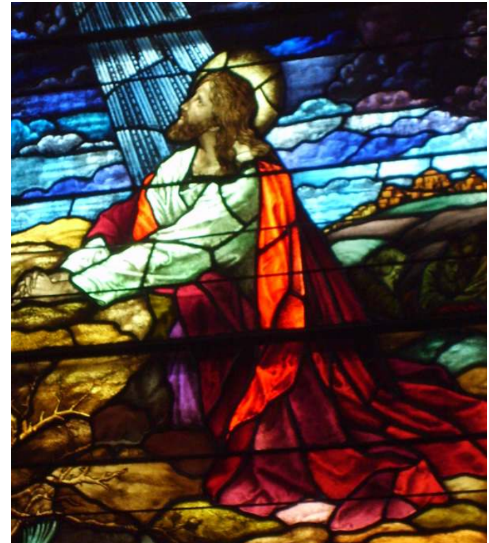
“Christ in the Garden”

Jesus Christ is the image of the invisible God, which is to say He is Himself very God. He took upon Himself our nature, being conceived by the Holy Spirit and born of the Virgin Mary. He died on the cross as a substitutionary sacrifice for the sins of the world. He arose from the dead in the body in which He was crucified. He ascended into heaven in that body glorified, where He is now, our interceding High Priest.