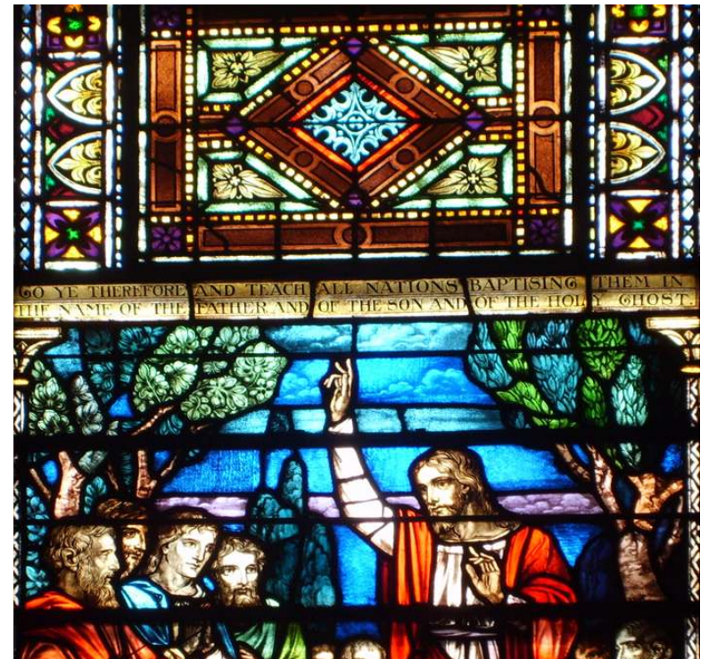
"The Great Commission"