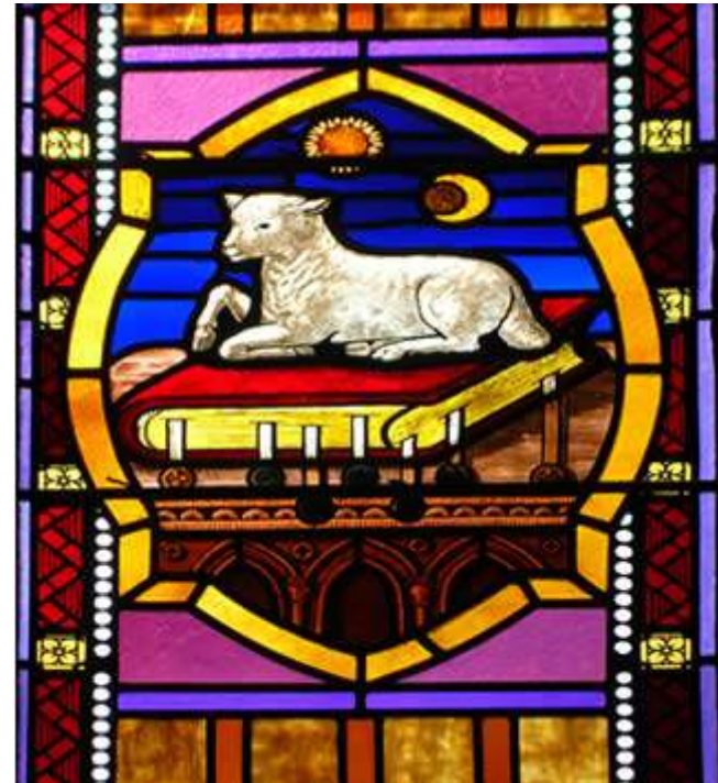
"The Lamb of God"

One of the primary goals of Brewer's online chapel program is to provide immediate opportunities to respond to the Word of God, in both word and deed. Although the idea of online communion service may be untraditional, and in no way should be considered a substitute for gathering together in person, it can be a great time of unity for the Body as well as a chance for the believer to focus on the sacrifice of Christ at Calvary. A detailed theological statement on the subject of online communion is available by contacting the chapel office.